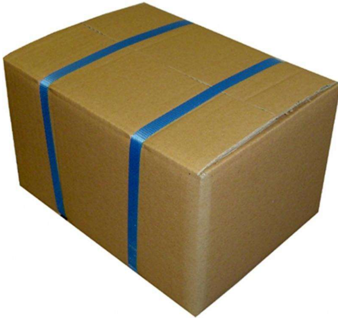
Pic. 4 Example on how to use PP Band