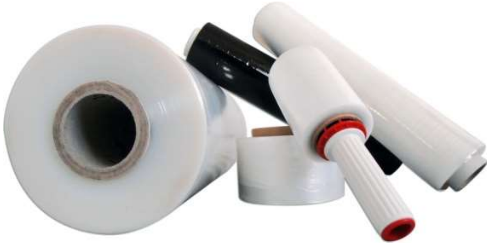
Pic 2. Stretch film available at local home centre