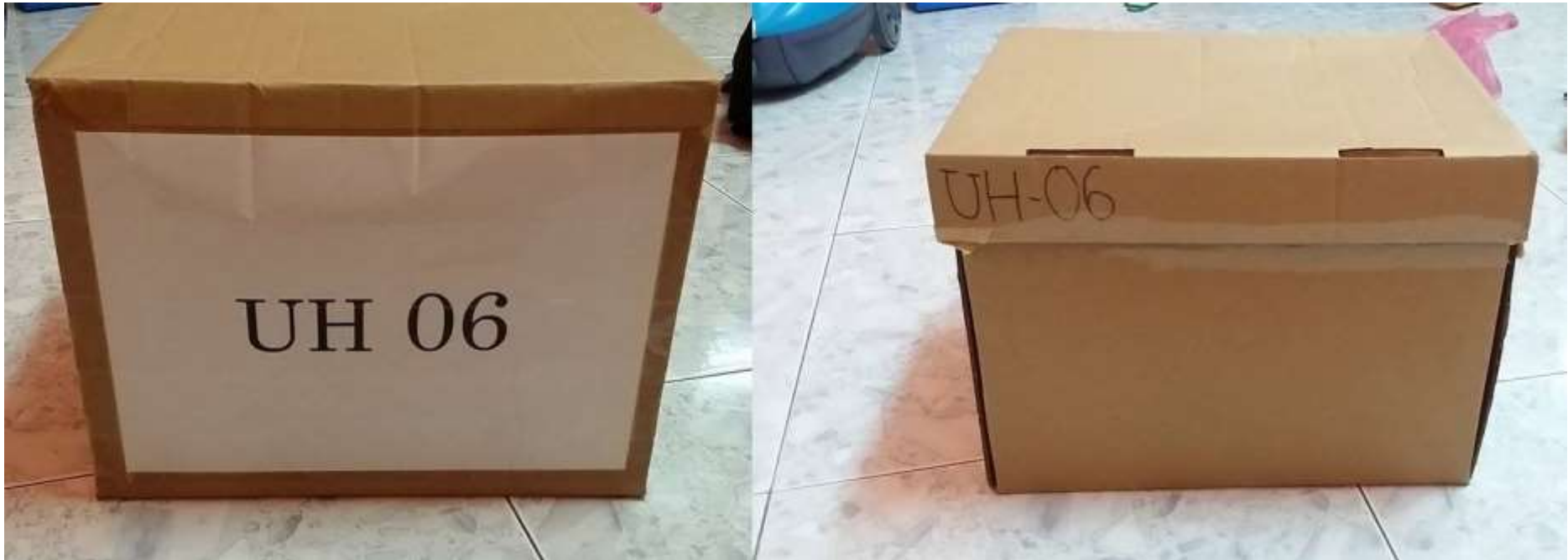
Pic. 1 Tagging paper example (UH) and number of the box (06)