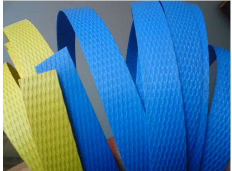
Pic 3. PP Band and PP Band Stopper available at homecenter